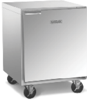
Model KULT27-R (shown with optional casters)